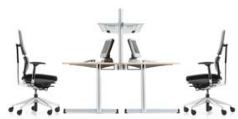
Separate double station with shared partition. Cleverly thought-out combo workspace that can also be adjusted to various working heights.