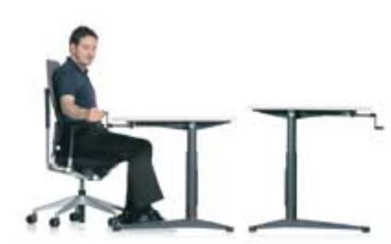
Ergonomics is the Tenaro hallmark. The desk can be easily adjusted to various working heights.