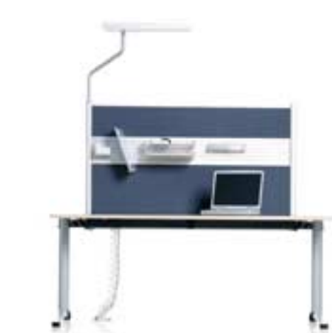
First glimpse: normal writing desk. Second glimpse: Cleverly thought-out technology – built-on screen for top organization and privacy, plus integrated flex-lights.