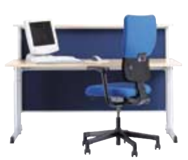
Whatever model you choose - Tenaro is sleek, functional and shapely.