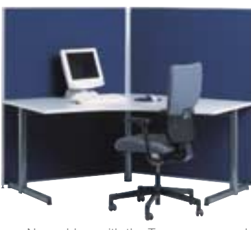
Saving space means saving resources. No problem with the Tenaro corner solution. Make your office work for you.