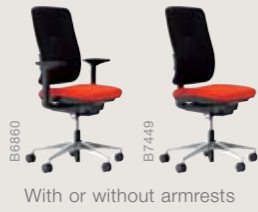
With or without armrests