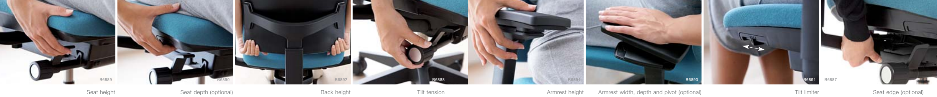
B6889 Seat height